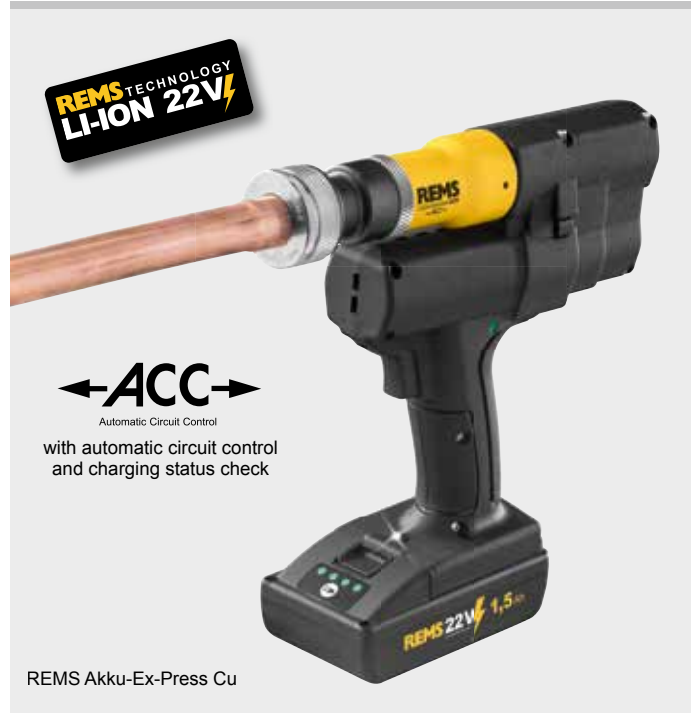
REMS Akku-Ex-Press Cu

High expanding force for perfect, split-second expanding. Thrust force 20 kN. Powerful electro-hydraulic drive with automatic return (ACC), with powerful battery motor 21.6 V, 380 W output, robust planetary gear, eccentric reciprocating pump and compact high power hydraulic system. Safety switch.