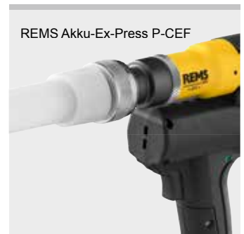
REMS Akku-Ex-Press P-CEF